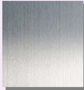
Platinum (Brush Polish)