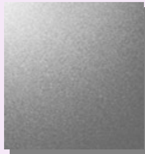
Granex (Bead Blast)