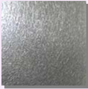
Vortex (Vibration Finish)