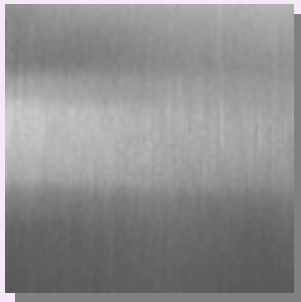
Cobalt (No4 Satin)