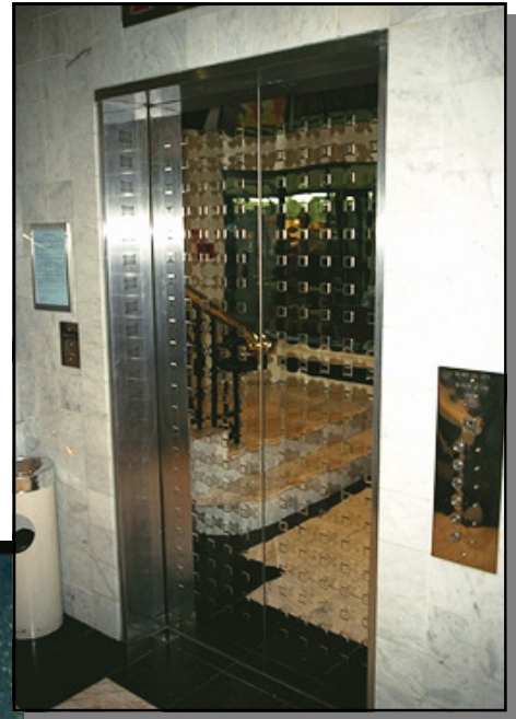
Super Mirror lift doors with "Impressions Range" pattern